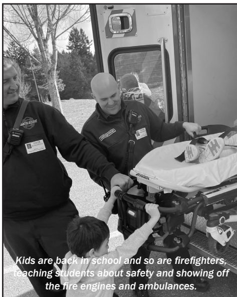
Kids are back in school and so are firefighters. Teaching students about safety and showing off the fire engines and ambulances.